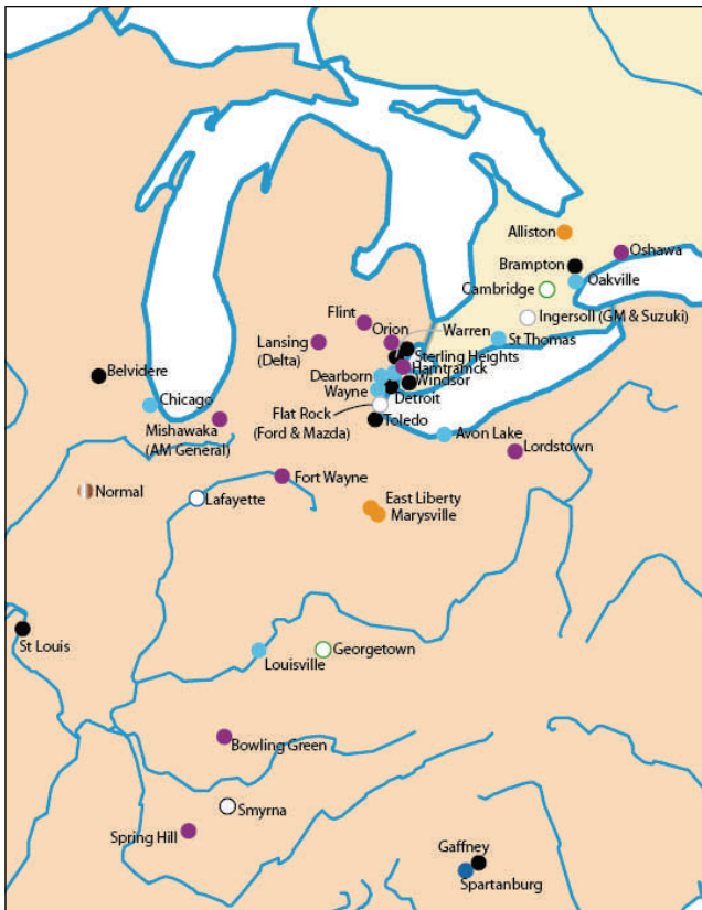
Maps of assembly plants by location and manufacturer

Global Automotive Logistics 2009 will enable you to gain insight into: